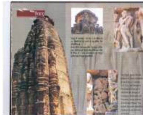
Jain Temple - Aarang